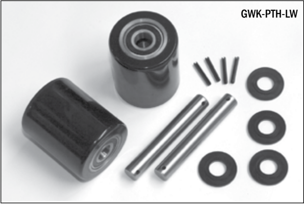
Load Wheel Kit

Note: Please confirm measurements before ordering: Load Roller 3.250" Diameter Steer Wheel 8" Diameter