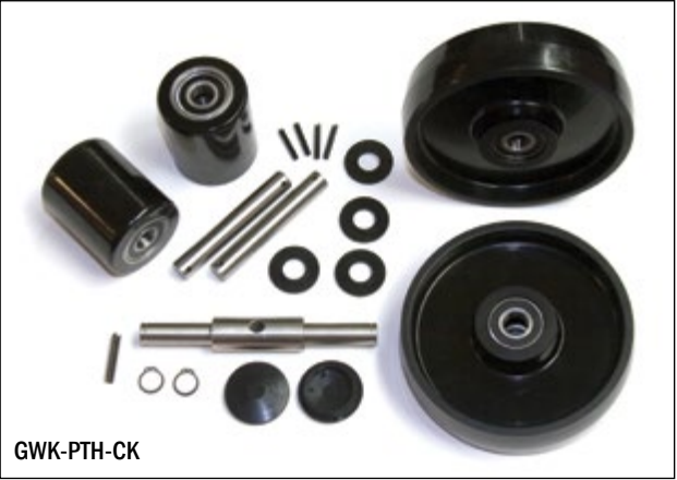
Complete Wheel Kit

Note: Please confirm measurements before ordering: Load Roller 3.250" Diameter Steer Wheel 8" Diameter