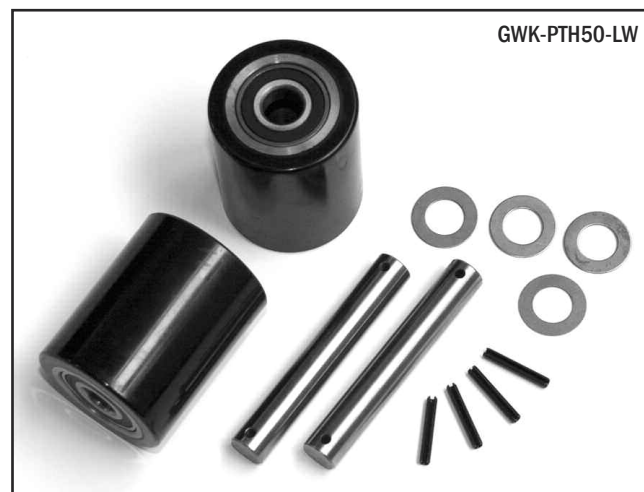
Load Wheel Kit