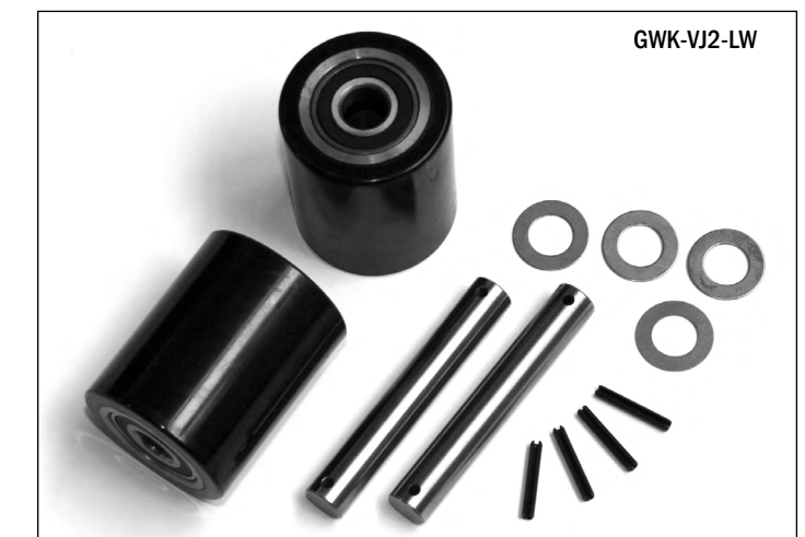
Load Wheel Kit