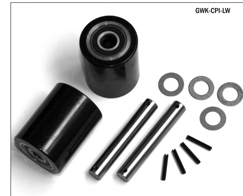
Load Wheel Kit