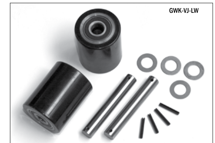
Load Wheel Kit